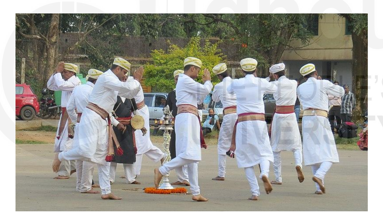
(Ceremonial dance by corgi men.)

about the household comprising of about 250 members. Srinivas compares the Coorg family structure to that of matrilineal Taravad of the Nayars and the patrilineal Illam of the Nambudris. Every village has its own headman and this position is hereditary and a council of elders. The Coorgs are patrilineal to the extent that only male members have any right in the right ancestral estate and it is the son who carries the legacy of the Okka. The division among men and women is quite sharp in the Okka, with special spaces designated to each gender. The verandah is used by the men and the women use the kitchen or other inner rooms to meet their guests. After marriage, women are no longer members of their natal Okka. Even in the natal Okka they do not have rights. In case of widowhood, women can remarry and there is a system of levirate (a marriage custom where the widow marries the brother of the deceased husband) in Coorg. Interestingly, while men need to be skilful in hunting, they also love to dance and they do so during the harvest festival and other religious festivals, while women watch from afar.